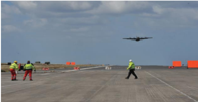
Fig 1: Runway clearing by employees

markings, non-cleared regions and wastes, that influences asphalt execution. For visual guides upkeep it is suggested that an electrical, electronic or comparable architect be in charge of these exercises. As air terminals are substances that speak to originals of tertiary associations, the upkeep action is principal for administrations offered to their clients. In this manner, it is required that those "administrations for the client" consider the accompanying angles: time, association, usage, cost and specialized learning. The administration of these perspectives, and also that relating to whatever remains of the air terminal association, ought to be guided to plan, program and counteract, for which the officer in control has an assortment of assets integrated [5].