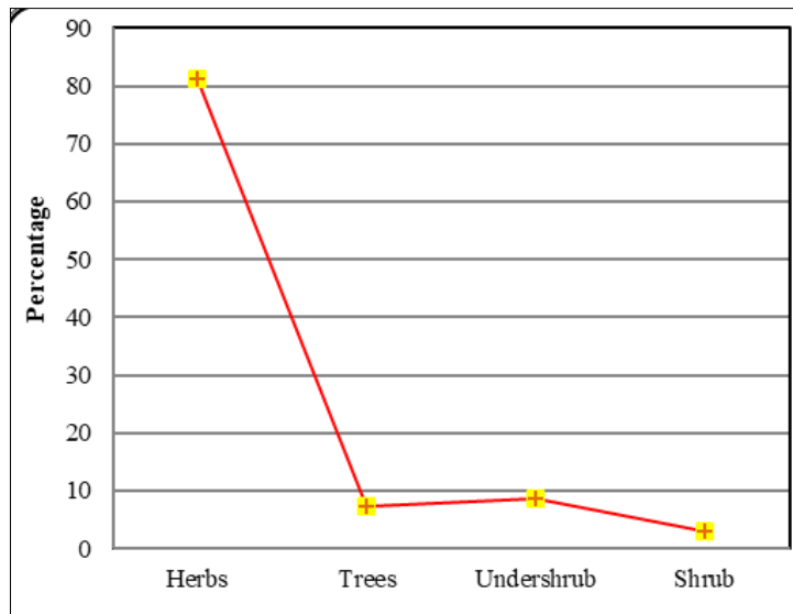
Fig 1: Graphics analysis of angiospermic wall flora of Rewa city.